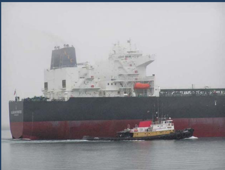
A tug escorts the Alaska Tanker Company's oil tanker Alaska Frontier through fog in Prince William Sound.