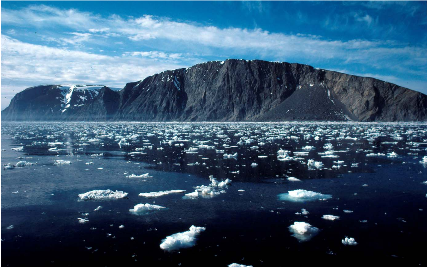
Bull Seal Bay with melting sea ice in June, St. Matthew Island, Alaska, USA. Sea ice can impede access to the spill area, making it difficult to track and encounter oil. Remote sensing techniques are being improved and refined to detect oil under and among sea ice, but they are not yet mature.