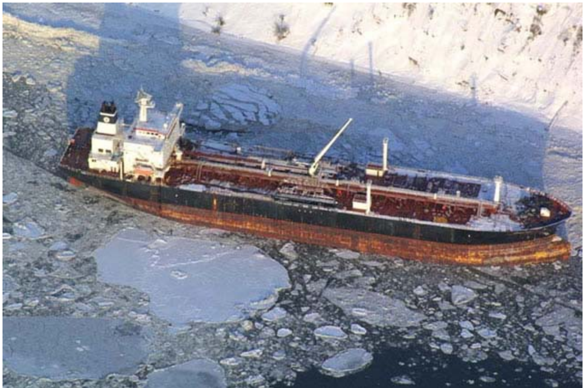
The oil tanker Seabulk Pride aground north of Nikiski in Cook Inlet, Alaska, USA, February 2006.

An accurate assessment of the capabilities and limits of a response system in its entirety is necessary to anticipate the conditions during which a response may or may not be effective. Once these limits have been defined, they should be applied to the earliest phases of the planning process, to begin to understand the interplay between spill risks and response feasibility. Other decision-making tools, such as net environmental benefit analysis (NEBA), which is used to consider the potential environmental risks and benefits of various response methods, cannot be applied without a thorough analysis of the potential effectiveness of various spill response systems under a range of conditions.