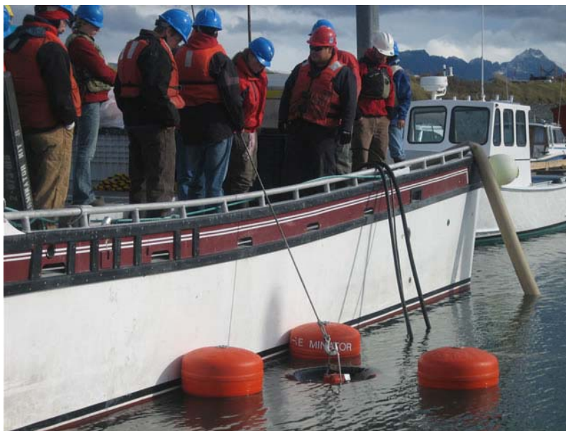
Alaskan fishermen observe an oil skimmer. Participants in this fishing vessel training program receive a combination of classroom time, hands-on learning with response equipment, and on-water training.

Effective implementation of an oil spill contingency plan requires that the operator's policies and strategies for oil spill response be communicated to all response and planning personnel, and that those personnel are in turn committed to carrying out those policies (Hollingsworth, 1991). In the context of arctic oil spill response, this means that the responders identified in the contingency plan must practice deploying equipment in the manner prescribed in the contingency plan, to ensure that planning assumptions regarding response time, recovery efficiencies, and logistical support are realistic. Contingency plans must be continually tested and revised to reflect lessons learned during actual deployments.