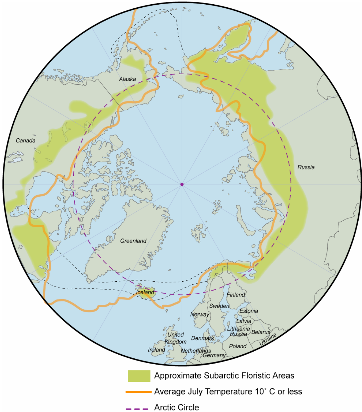
Figure 1: Select delineations of arctic and sub-arctic regions.