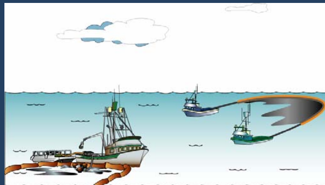
Figure 2. Typical on-water mechanical response system

Figures 2 through 4 show the typical components of the three response systems described above. All three technologies require surveillance and spill tracking to identify the location, spreading and condition of the spilled oil in order to select and apply the appropriate response equipment and tactics. All three also require logistical support to transport equipment and trained personnel to the spill site, deploy and operate the equipment, and decontaminate the equipment when response operations are complete. Spill responders must be able to safely access the spill site in order to deploy the equipment. Accessing the spill site is often one of the biggest challenges, particularly in remote areas.